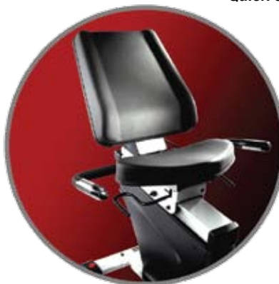
Extra Large ComfortPlus™ seat with adjustable seat back