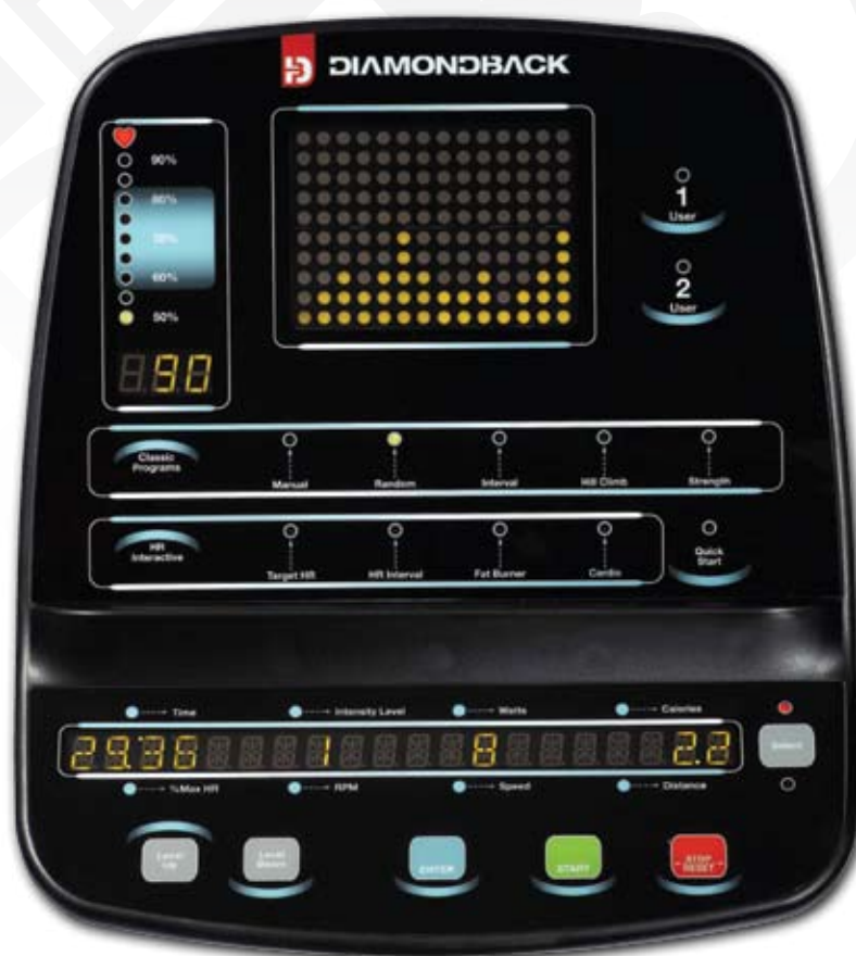
Quick Start Feature