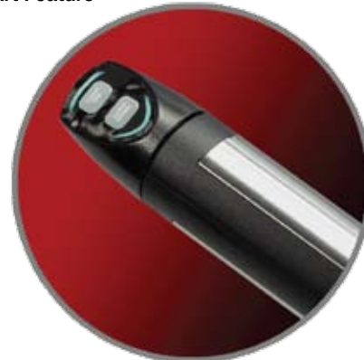
Handlebar Remote Control