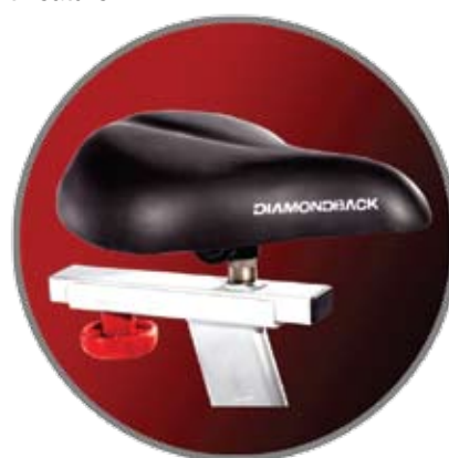
Hi-density foam saddle with fore/aft adjustment