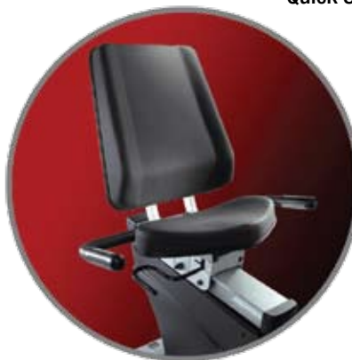
Extra Large ComfortPlus™ seat with lumbar support