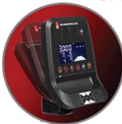
Adjustable Console Position