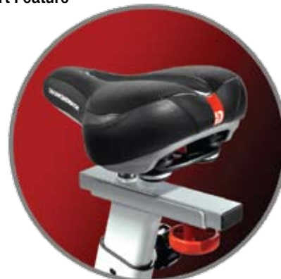
Comfort Ride™ saddle with fore/aft adjustment