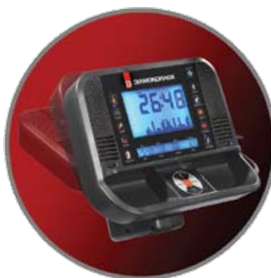
Adjustable Console Position