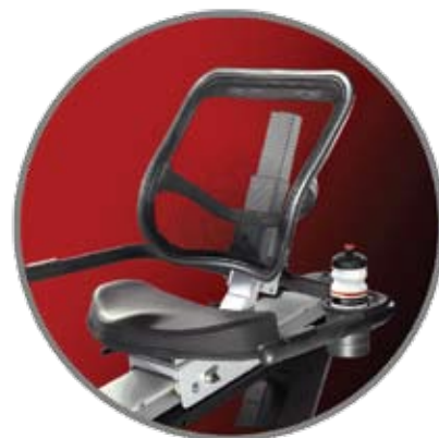
Adjustable Mesh Seatback with Lumbar Support