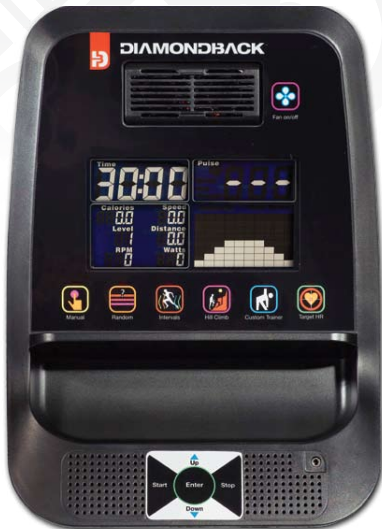
Quick Start Feature