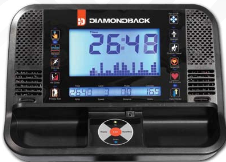
Quick Start Feature