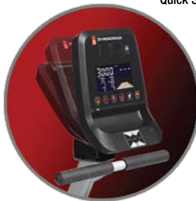
Adjustable Console Position