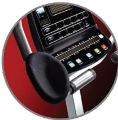
Comfortable elbow rests and grips