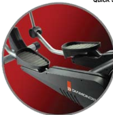
Hinged Foot Pedal