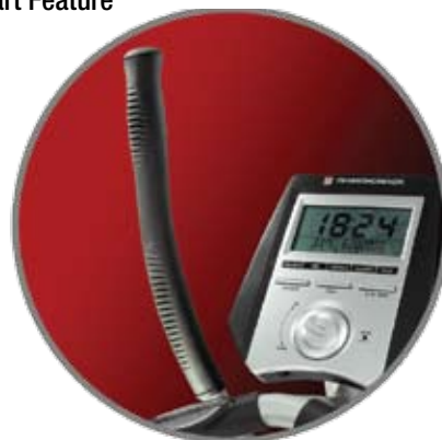
Ultra Comfortable Krayton Grips