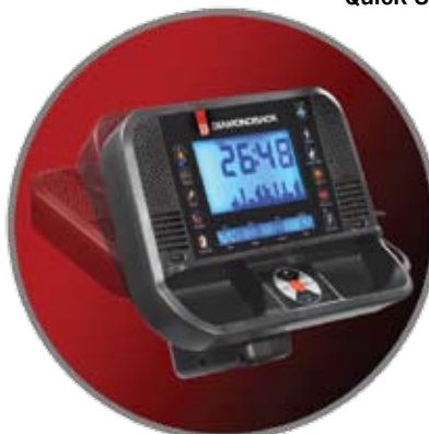
Adjustable Console Position