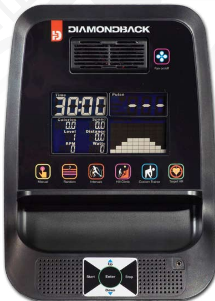
Quick Start Feature