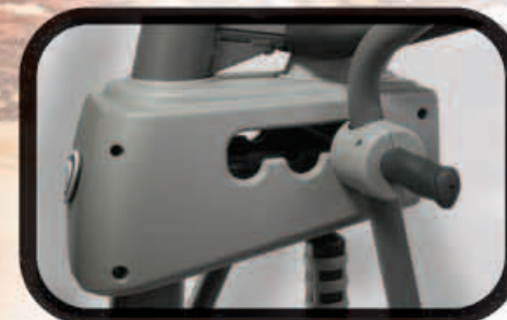
BodyFit™ Stride Adjustment

DIAMONDBACK FITNESS: DOING IT YOUR WAY • DIAMONDBACK FITNESS: DOING IT YOUR WAY • DIAMONDBACK FITNESS: DOING IT YOUR WAY