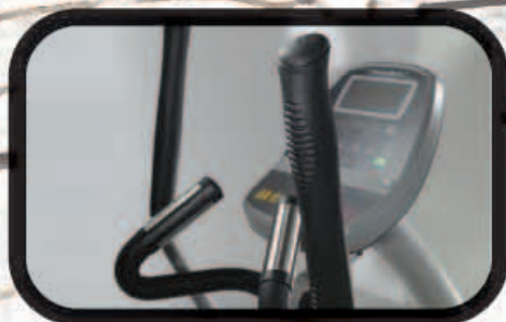
Comfortable Handlebars and Grips