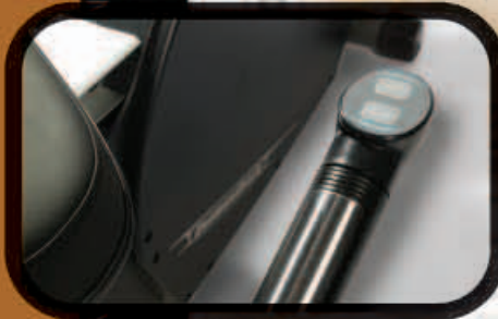
Handlebar Remote Control