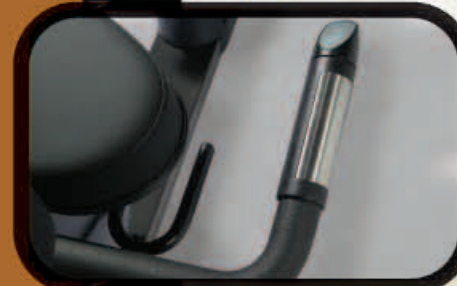
Handlebar Remote Control