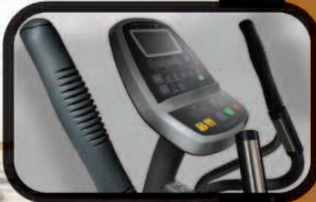
Krayton Comfort Grips