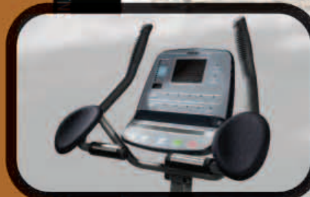
Elbow Rests and Grips