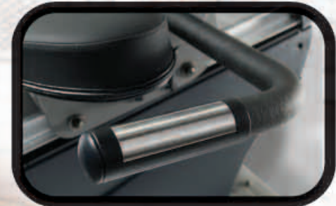
Contact Hand Pulse Sensors