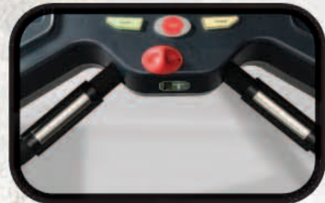
Hand Pulse Sensors