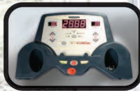
Designer Console with Large Display