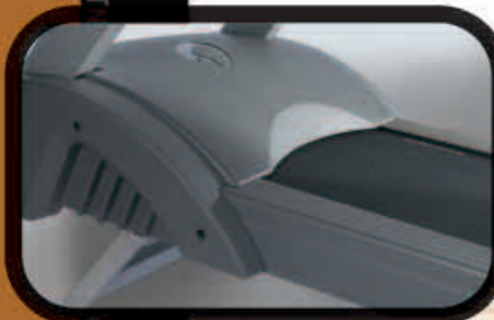
Orthopedic Belt and 15% Incline