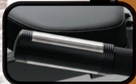
Contact Hand Pulse Sensors

Large Foam Padded Seat with Lumbar Support