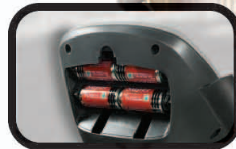
Battery and Plug-in Options