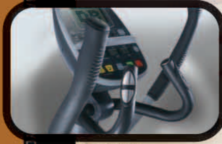
Comfortable Handlebars and Grips