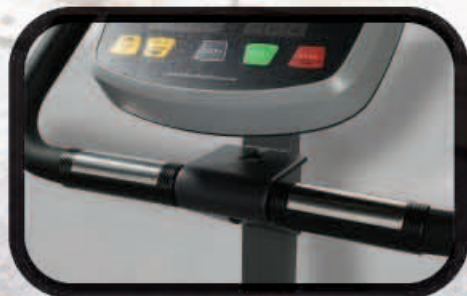
Hand Pulse Sensors

DIAMONDBACK FITNESS: DOING IT YOUR WAY • DIAMONDBACK FITNESS: DOING IT YOUR WAY • DIAMONDBACK FITNESS: DOING IT YOUR WAY