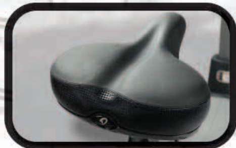
Wide Padded Seat