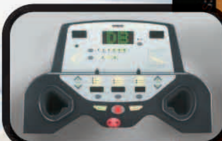
Designer Console with Scrolling Display