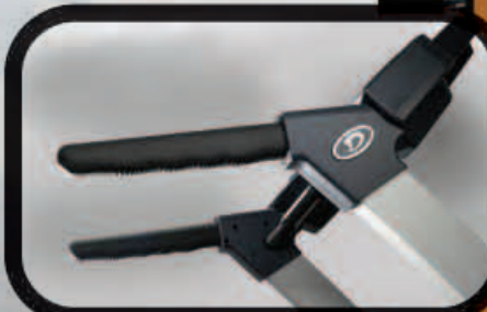
Exclusive Comfort Grips