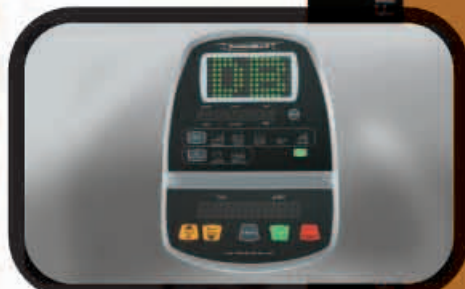
Easily Programmable Console