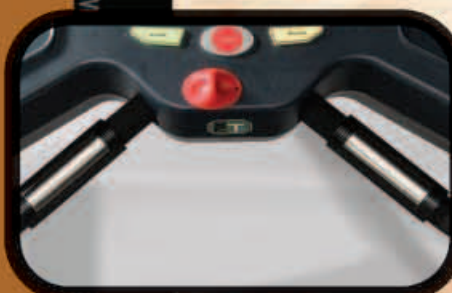
Hand Pulse Sensors