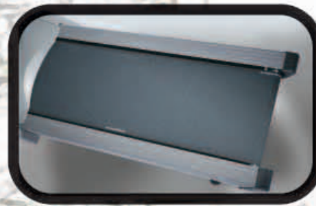
Large Running Deck with Durable Belt