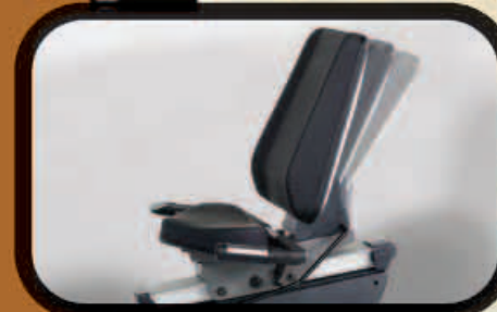
Adjustable Reclining Seat and Aluminum Track