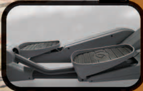
Hinged Foot Pad