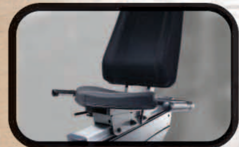
Comfort Plus® Adjustable Seat Track

IMPORTANT: If pregnant, always consult your physician before beginning any exercise program.